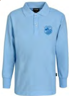
Long Sleeve Polo NHI Embellished School Logo