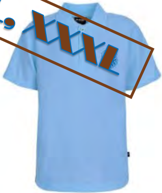
Short Sleeve Polo NHI Embellished School Logo