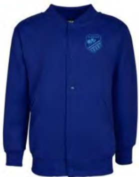
Bomber Jacket NHI Embellished School Logo