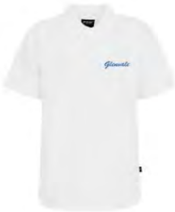
Short Sleeve Polo NHI Embellished School Logo