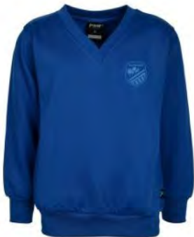
V-Neck Windcheater NHI Embellished School Logo